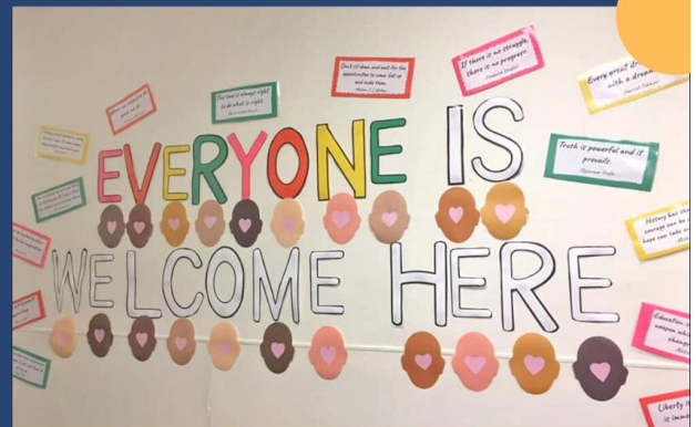
Special Education Day Schools