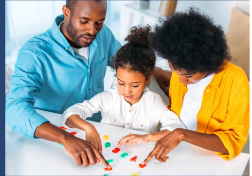
PHILLIPS~ Family Partners