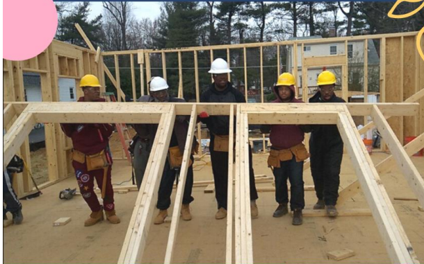
PHILLIPS~ Career Partners