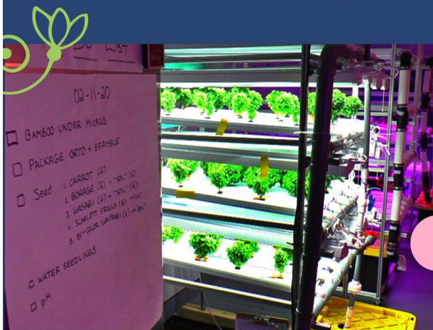
SpringForward~Employment Social Enterprises